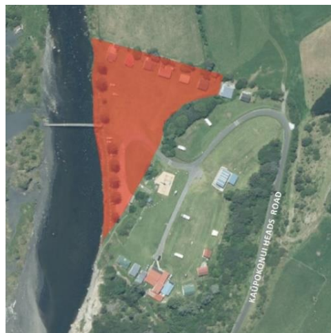
KAŪPOKONUI BEACH RESERVE. NOTE: THERE IS A CAMPGROUND WITHIN THE RESERVE PEOPLE CAN CAMP AT FOR A FEE.