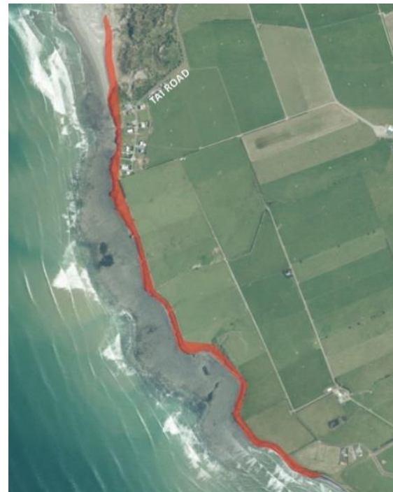
ŌAONUI RESERVE, TAI ROAD