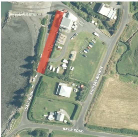
CAPE EGMONT BOAT CLUB AND HISTOIC LIGHTHOUSE AREA