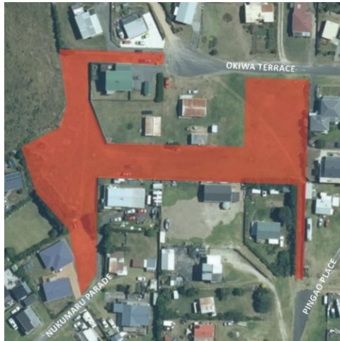
OKIWA TERRACE RESERVE. NOTE: THERE IS A CAMPGROUND OFF NUKUMARU PARADE, PEOPLE CAN CAMP THERE FOR A FEE.