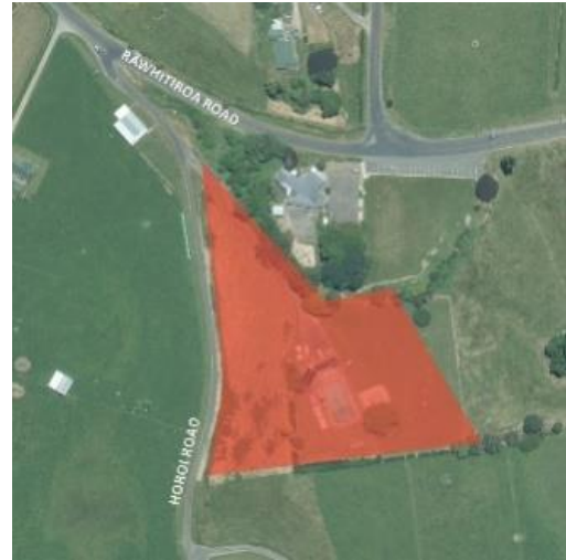
RĀWHITIROA SWIMMING POOL AND RESERVE