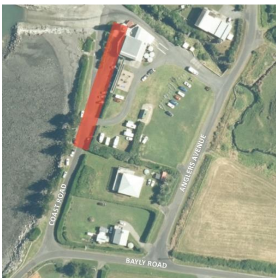
CAPE EGMONT BOAT CLUB AND HISTOIC LIGHTHOUSE AREA