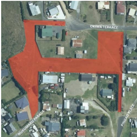
OKIWA TERRACE RESERVE. NOTE: THERE IS A CAMPGROUND OFF NUKUMARU PARADE, PEOPLE CAN CAMP THERE FOR A FEE.