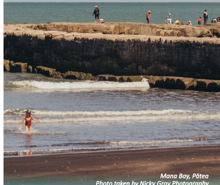
Mana Bay, Pātea