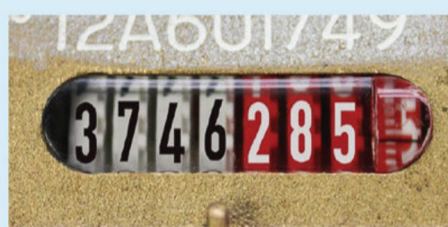
Previous night's reading 10:00pm

The example below shows that about 25 litres of water were used during the night. This indicates a leak.