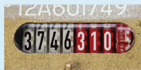
Early-morning reading 7:00am

schemes are always in high demand during the peak season. The water supply is limited and it is important that all users do what they can to manage their water use efficiently to ensure there is enough water to go around. One of the easiest things to do is to check your meter and check for leaks.